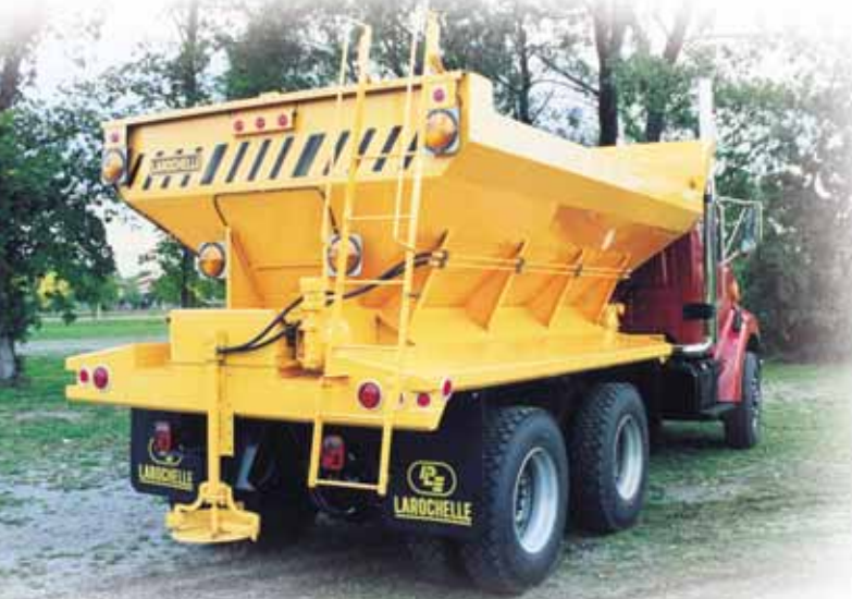
Rear spinner configuration (SC model) Stretched out conveyor design allows the installation of a rear spinner without any major modifications